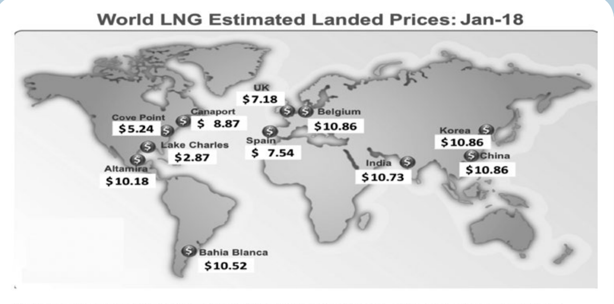
Exhibit 1. LNG Landed Prices During January 2018 in $/MMBtu's

Note: Prices are the monthly average of the weekly landed prices for the listed month. Landed prices are based on a netback calculation.